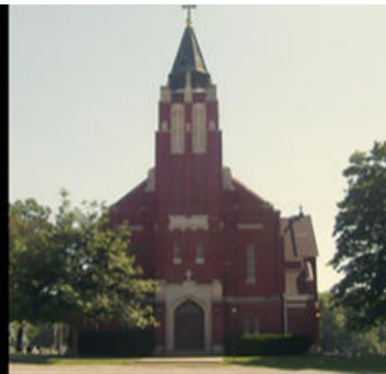
+ HOLY CROSS WENDELIN