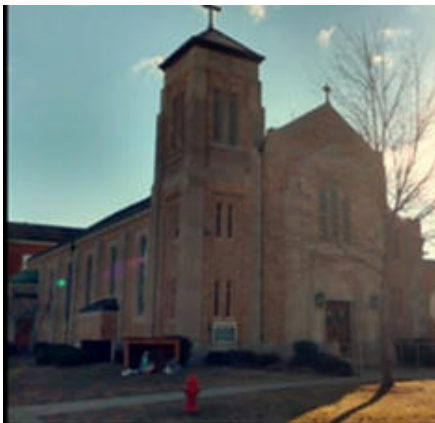
+ ST. JOSEPH OLNEY