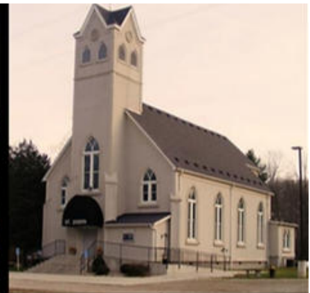
+ ST. JOSEPH STRINGTOWN