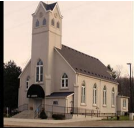
✚ ST. JOSEPH STRINGTOWN