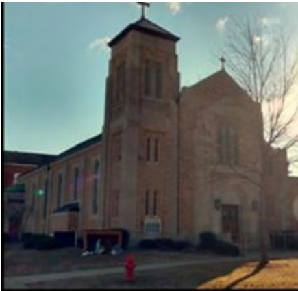
✚ ST. JOSEPH OLNEY