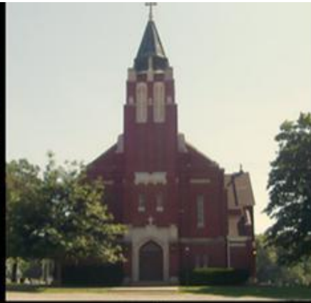
✚ HOLY CROSS WENDELIN