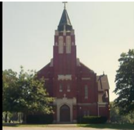
+ HOLY CROSS WENDELIN