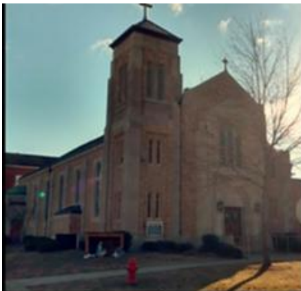
+ ST. JOSEPH OLNEY